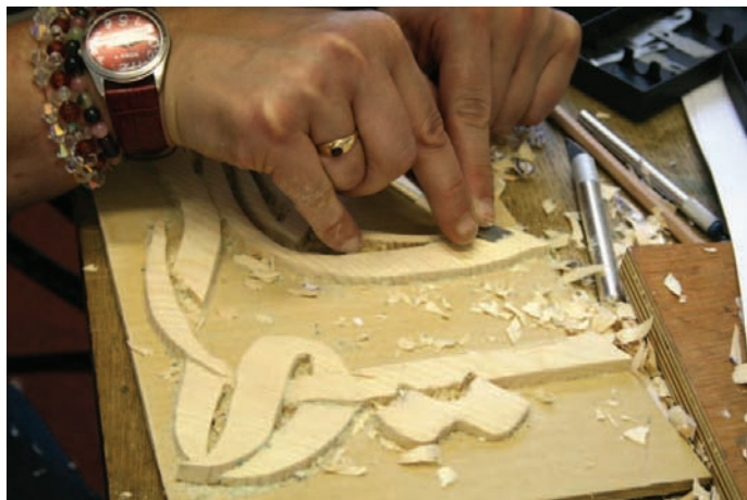
A better class of voluntary sector cut: carving Arabic calligraphy – part of a Women's project run at the ARK (see the final results on page 2)

Produced by Ealing Community and Voluntary Service